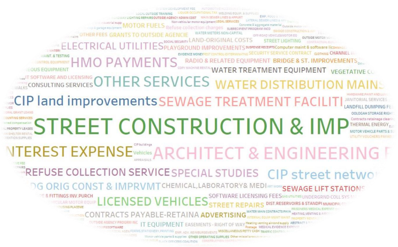
The size of the words are proportional to the amount of spend.

This amount of spend can be overwhelming when determining where deliberate misappropriation of assets is occurring. Our analysis found the City of Tulsa's vendor and contractor spending in the following categories in calendar year 2017: