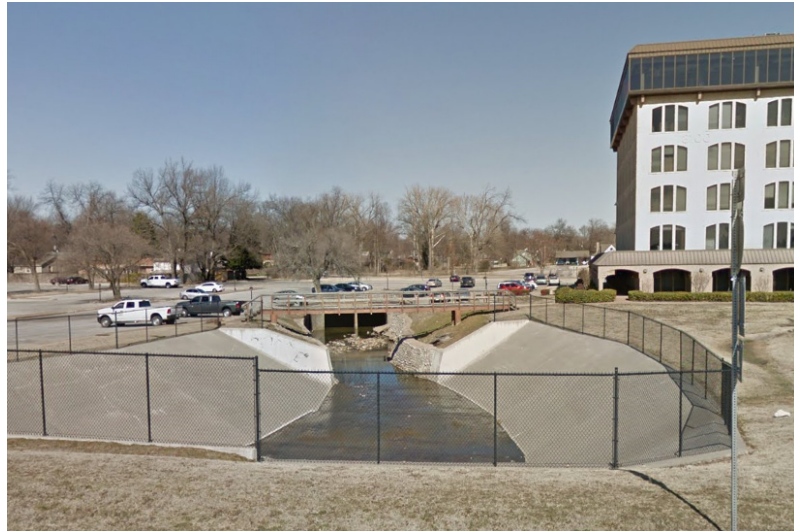
The West Branch of Joe Creek emerges from underground in RLA #26 and passes under the Skelly Dr. and I-44 just west of Harvard Ave. to join with the East Branch beneath I-44.

Upper Joe Creek has two branches: West Branch and East Branch. The West Branch rises near E. 23 rd St. and S. Oswego Ave. and flows south for about 3 miles to join the East Branch at Skelly Dr. and I-44, and then the mainstem at Manion Park. Almost all of the West Branch is underground. The creek surfaces at E. 28 th St. and S. Florence Ave. as the source of Lakewood Lake, and again briefly between E. 33 rd and E.