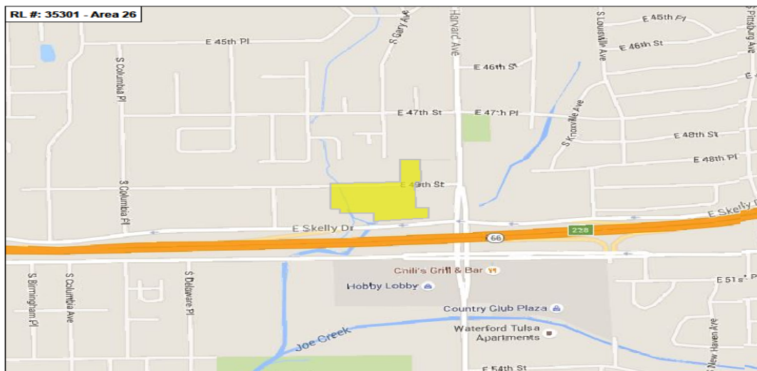
RLA #26 is located in the West Branch of Joe Creek drainage on the north side of Skelly Dr. and I-44, generally between S. Florence Ave. and S. Harvard Ave.

The general location of RLA #26 is shown on the map below and on the more detailed photo/topography map on page 5. The detailed map identifies properties, County Assessor parcels, floodplains, and the existing storm sewer system.