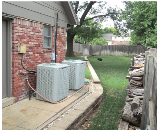
This platform and wall protect the home and air conditioning equipment from shallow flooding.

steps they can to protect their homes, families and possessions. City staff is available to explain the local flood risk, interpret floodplain maps, and determine if an area or property has drainage problems or a history of prior flooding. Staff can also discuss the ways a specific property can be protected from flooding. An Elevation Certificate can