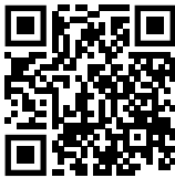
SCAN TO VIEW PY 2023