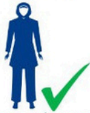
Religious swimwear such as Burkinis