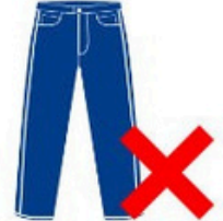
Denim, khakis or sweat pants