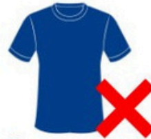
T-shirts and jerseys