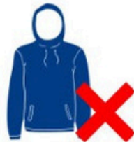
Jackets or hoodies