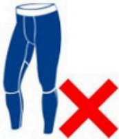
Compression pants and shirts