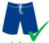
Board shorts or swim trunks

Swimwear for females must sufficiently cover breasts, genitals and butt. Swimwear for males must sufficiently cover genitals and butt. See additional coverings approved over acceptable swimwear below: