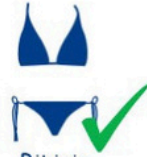
Bikinis (including tankinis)