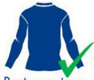
Rash guards or surf wear